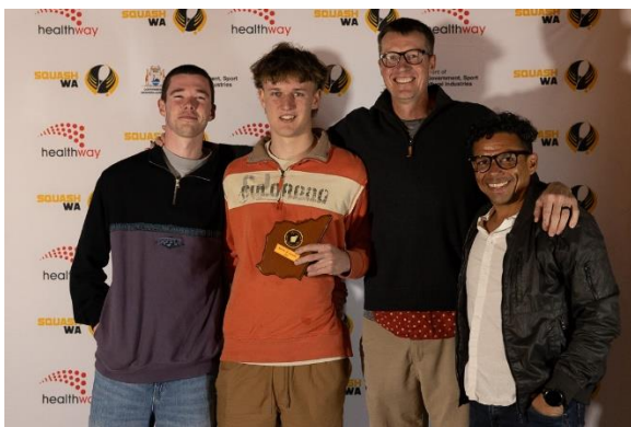
Men's B Grade: W Leschenault