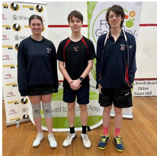
Warwick SHS 10-11-12s