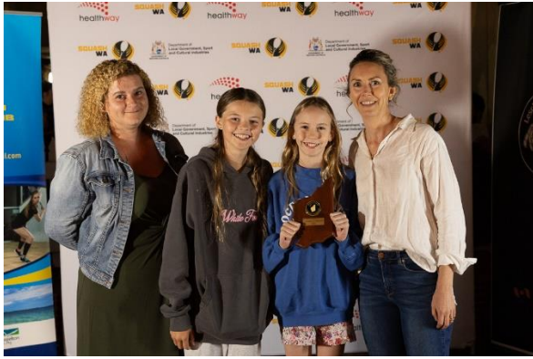
Ladies C Grade: W Busselton