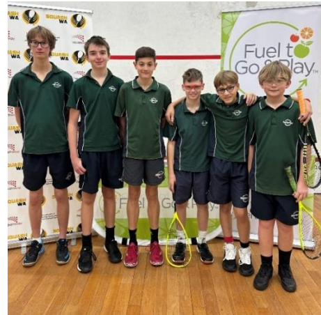
Shenton College 7-8-9s