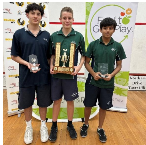
Boys 10-11-12s Winners - Shenton Coll.