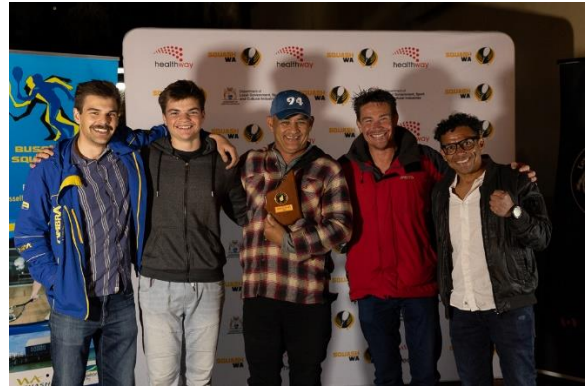
Men's G Grade: W Geraldton RU Mandurah