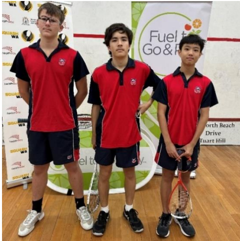
Carine SHS 10-11-12s