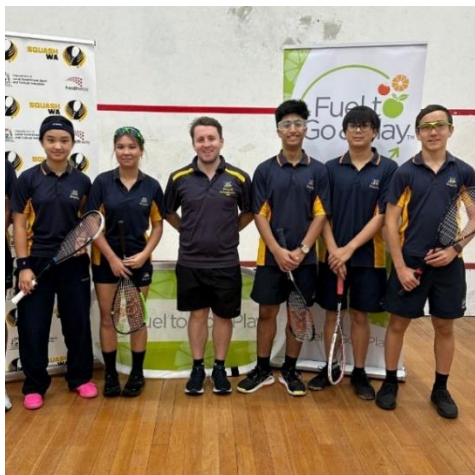
Perth Modern 7-8-9s