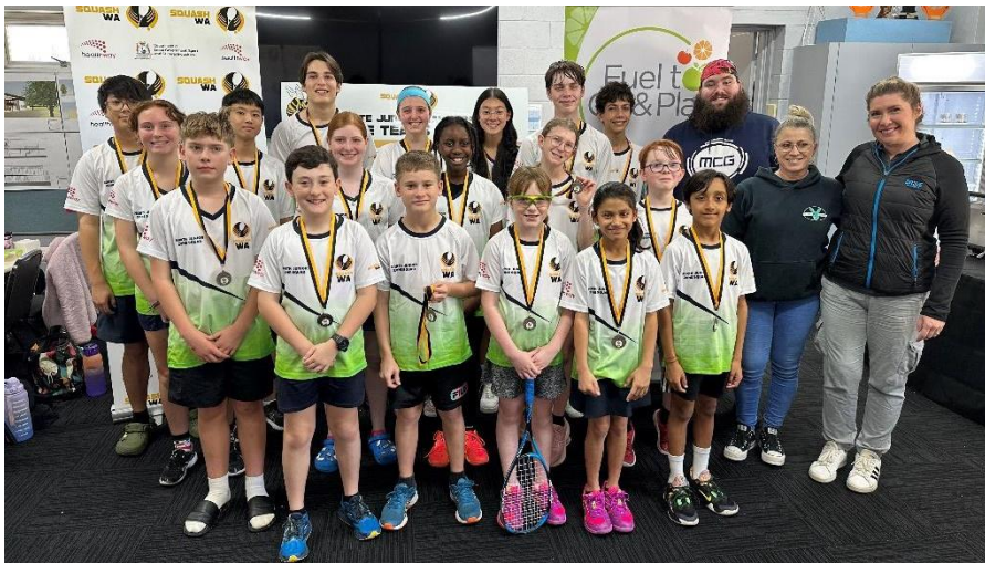
3rd place - Country (representation from Kalgoorlie, Geraldton, Busselton, Moora, Mandurah, Bunbury and Leschenault)