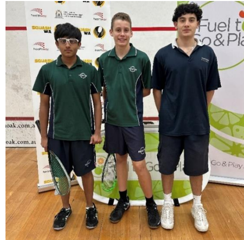
Shenton College 10-11-12s