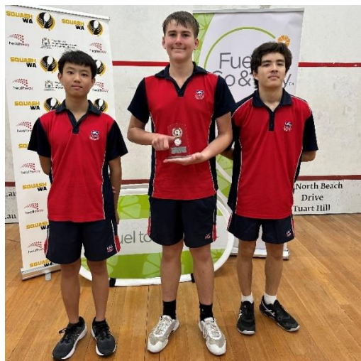
Boys 10-11-12s RU - Carine SHS