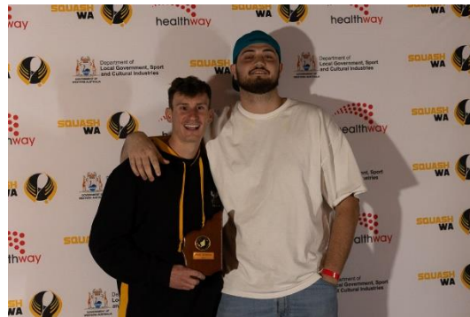
Men's H Grade: W Goldfields RU Narrogin