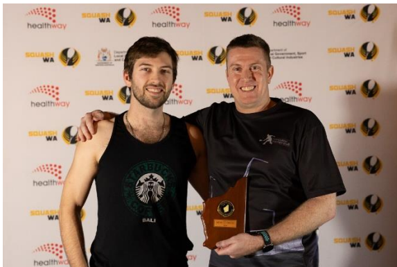
Men's D Grade: W Mandurah RU Leschenault