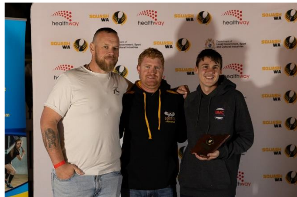
Men's E Grade: W Goldfields RU Bunbury