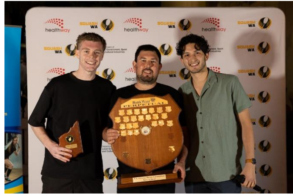
Men's A Grade: W Goldfields