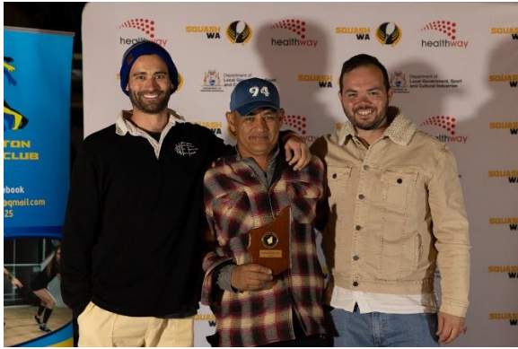
Men's F Grade: W Geraldton RU Leschenault