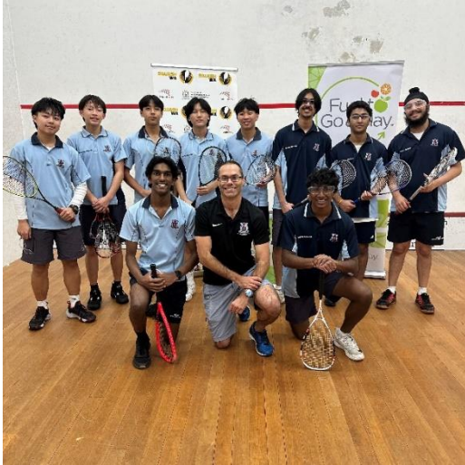
Willetton SHS 10-11-12s