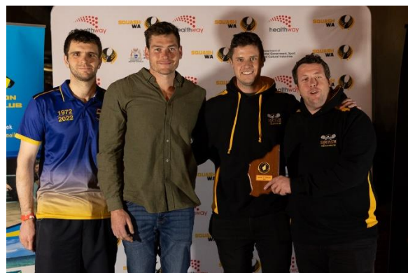
Men's C Grade: W Goldfields