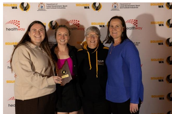
Ladies B Grade: W Goldfield 1 RU Goldfields 2