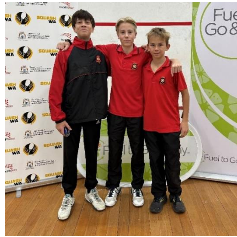
Aquinas College 7-8-9s