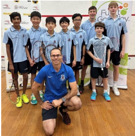
Willetton SHS 7-8-9s