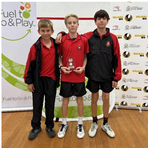
Boys 7-8-9s RU - Aquinas College