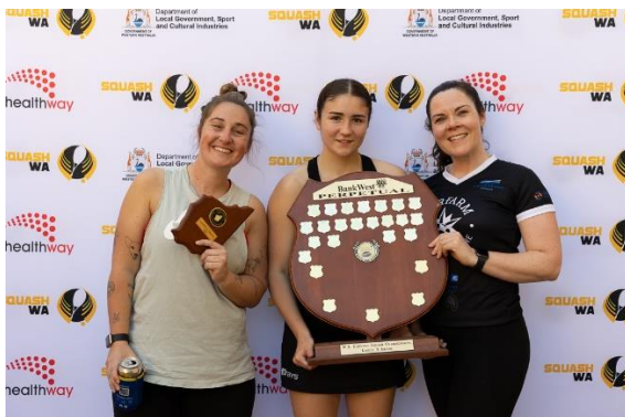
Ladies A Grade: W Combined Country RU Narrogin