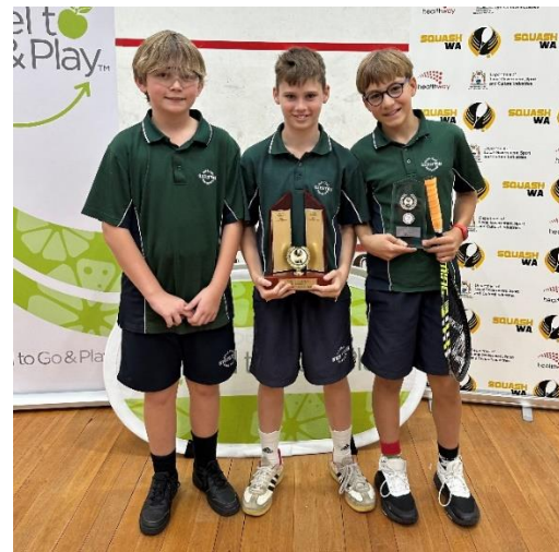
Boys 7-8-9s Winner - Shenton College