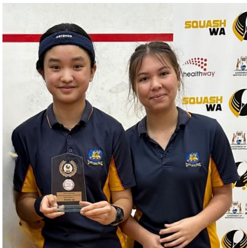
Girls 7-8-9s RU - Perth Modern