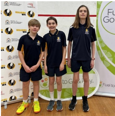
Governor Stirling SHS 7-8-9s